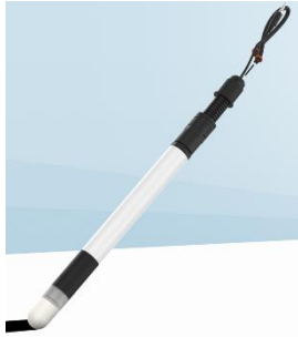
TEROS 32 (METER)