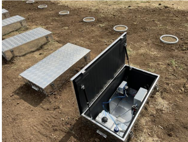
Lysimeter site INRAE (Clermont-Ferrand, France)