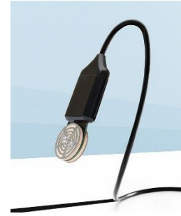
TEROS 21 (METER)