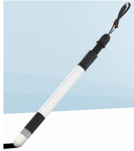
TEROS 32 (METER)