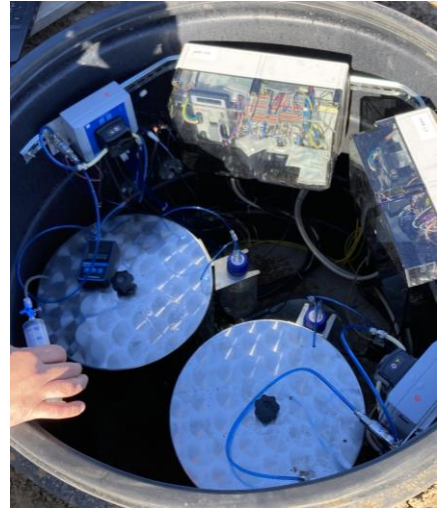
Lysimeter site Hochschule Geisenheim University